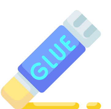
12 Glue Sticks