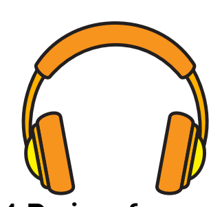
1 Pair of over the ear Headphones