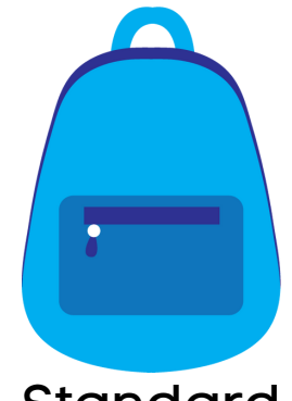
Standard Backpack (no wheels)