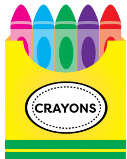
2 Boxes 24ct. Crayola Crayons

** Completed Immunization Form & Birth Certificate/Hospital Record