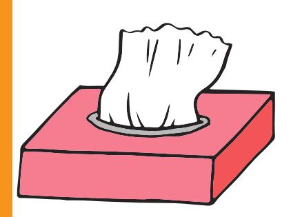
1 Box of Kleenex