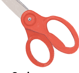
Scissors -Fiskar Only